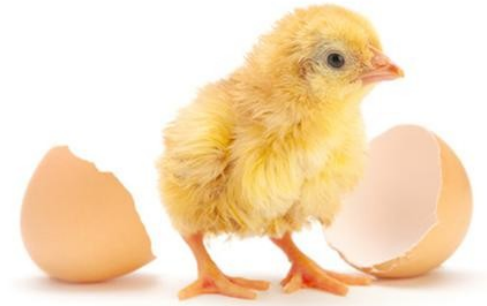
(un) poussin (UN) POUSSIN