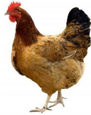
(une) poule (UNE) POULE