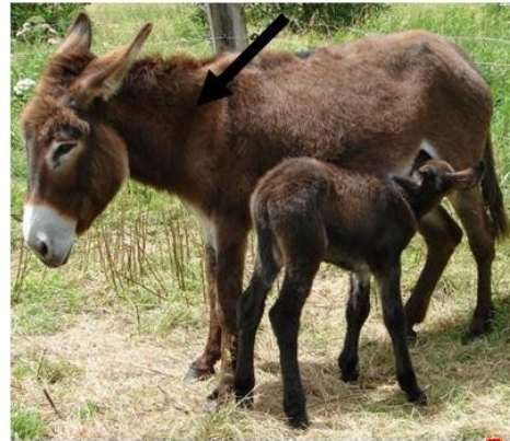
(une) ânesse (UNE) ANESSE