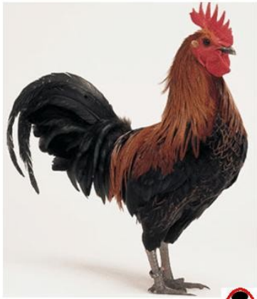
(un) coq (UN) COQ